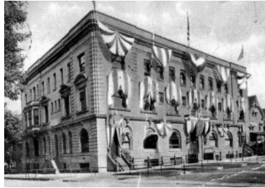
An early photo of the Galena Building

The Rural House hotel once occupied this site but was destroyed by this fire in 1891.